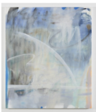
Espy of free-styler alongside lane, public outdoor pool