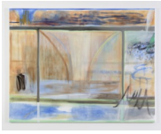
The Cinematic Vermouth