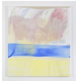
Tune of Schweppervescence