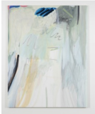
Pouring a diagram, adidas sneakers cement me

2021 oil on linen diptych 248 x 122 cm $9,000