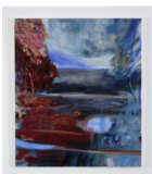
Some coloured lights in a park at night