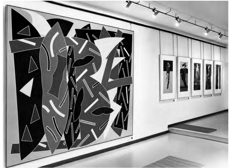
2. Installation view 'Alun Leach Jones: Recent Paintings', Rudy Komon Gallery, Sydney 1982